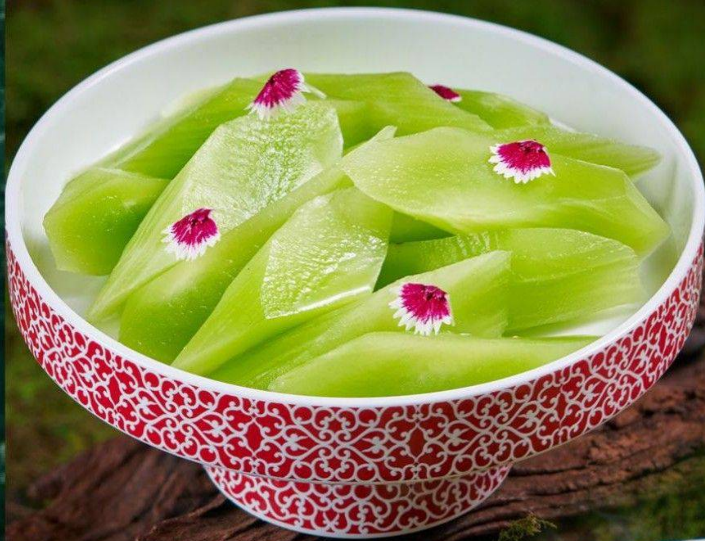
萵筍 CELTUCE MOP 42