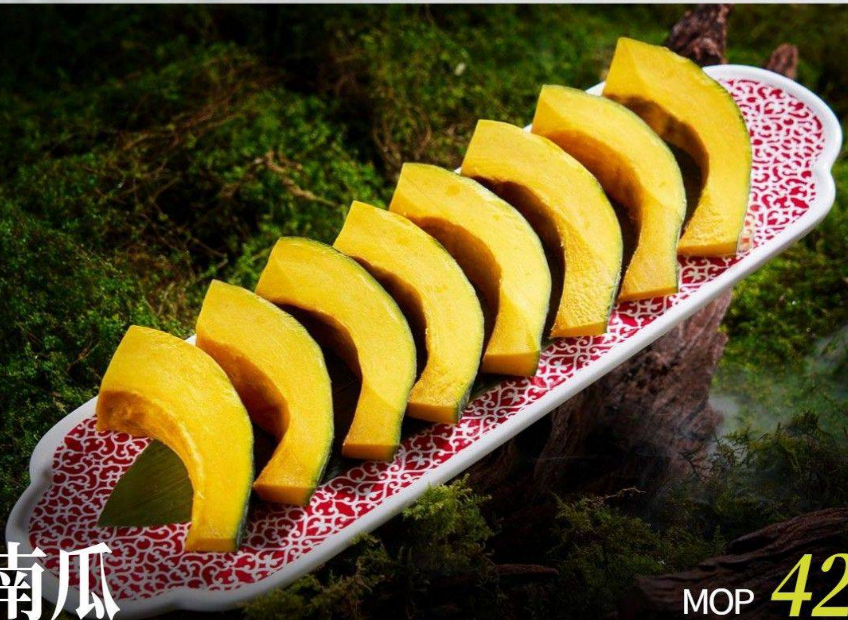
板栗南瓜 MINI PUMPKIN