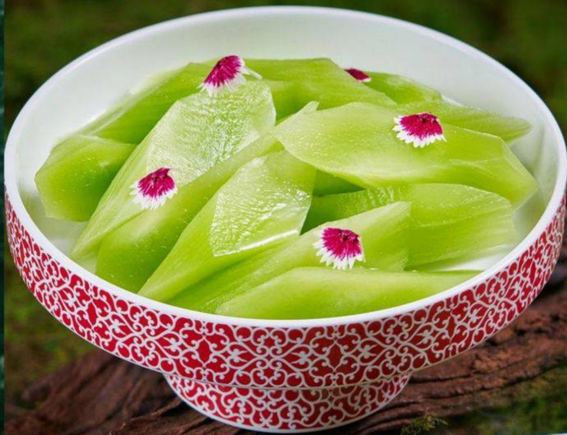
莴笋 CELTUCE MOP 42