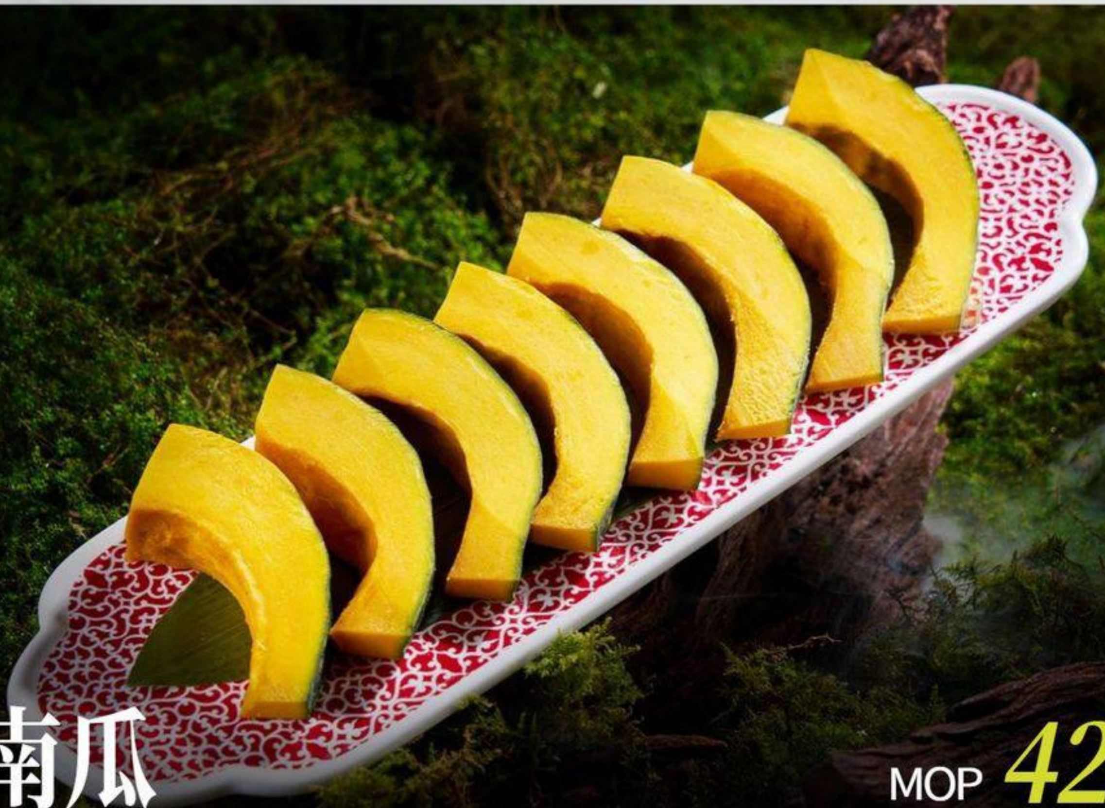
板栗南瓜 MINI PUMPKIN