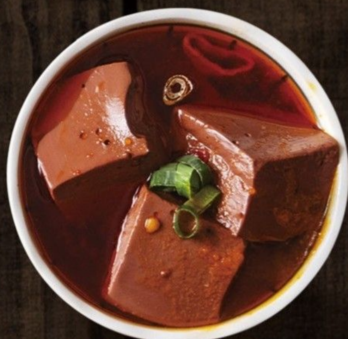
台灣麻辣鴨血 Spicy Duck Blood Curd