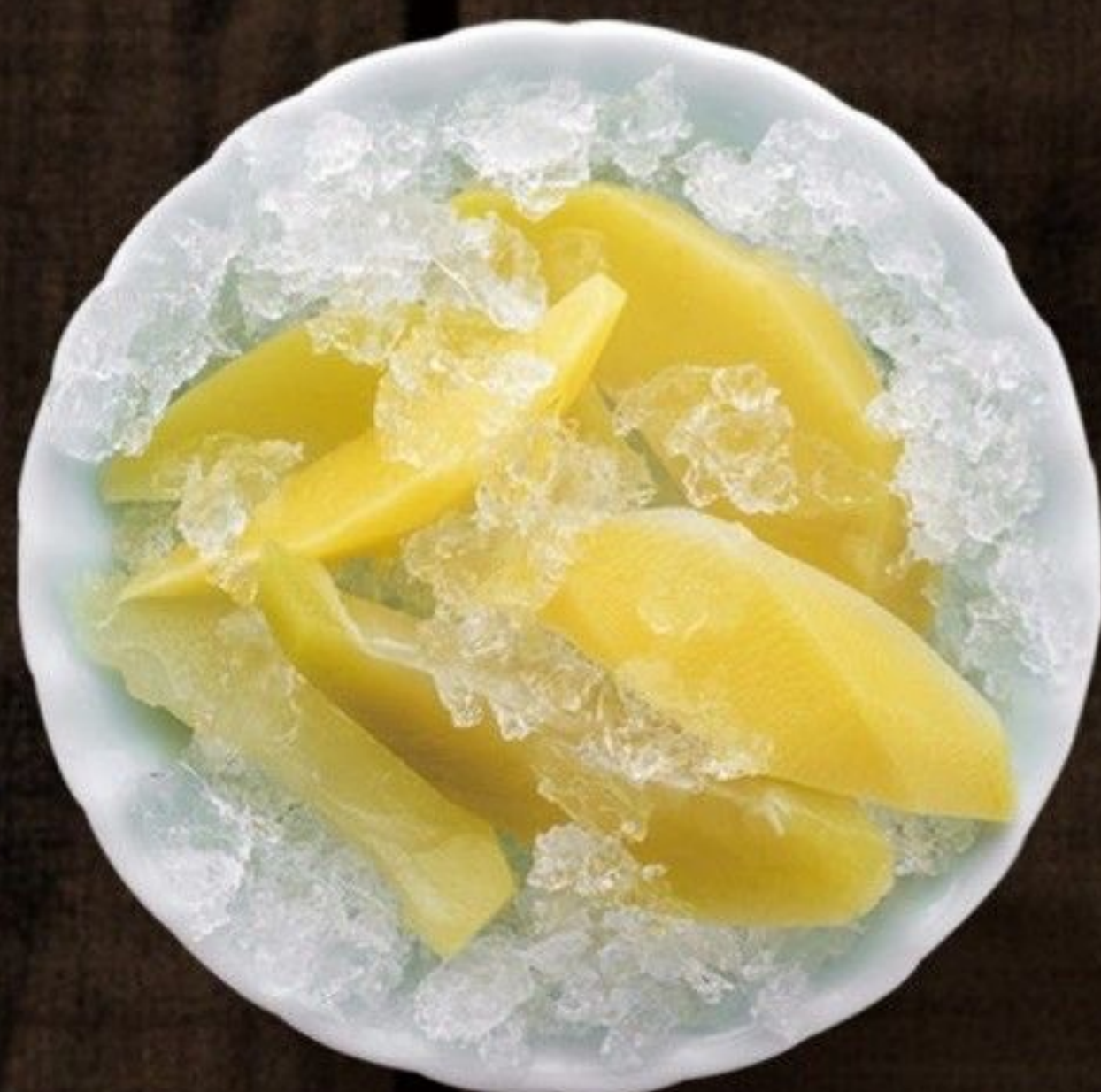
芒果青 Pickled Mango