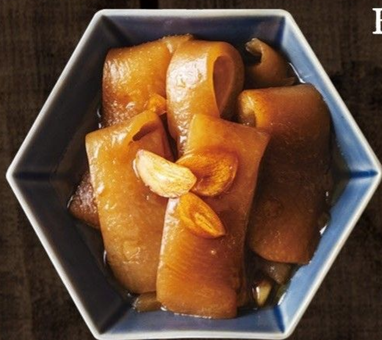
滷豬皮 Braised Pork Skin