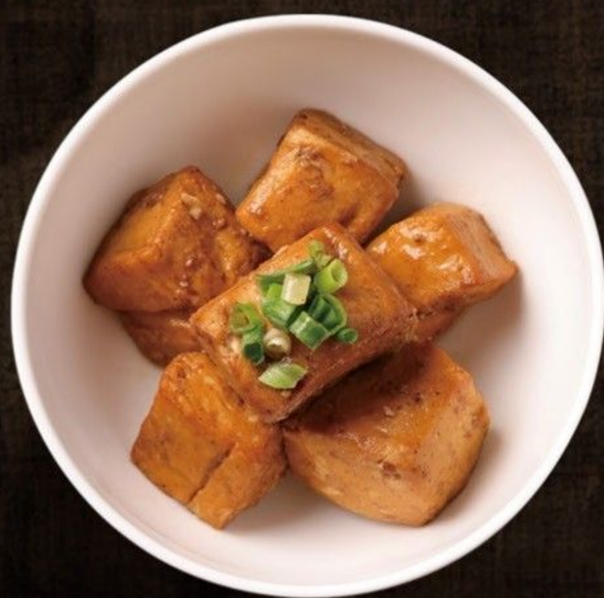
滷豆乾 Marinated Dried Tofu