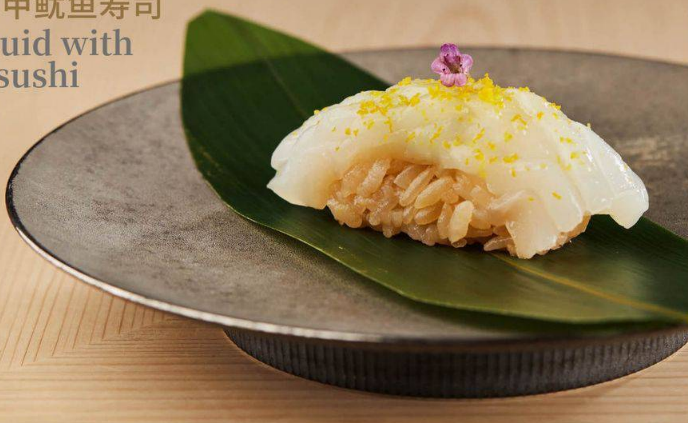
❖ 紫苏文甲鱿鱼寿司 Ika squid with shiso sushi MOP 42