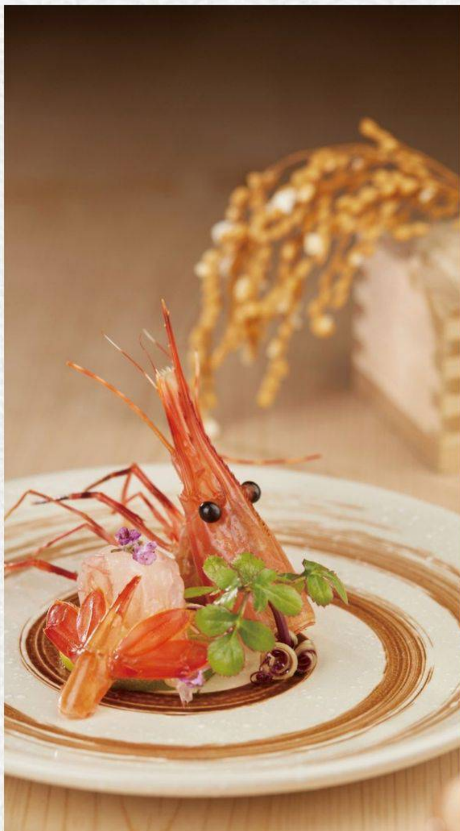
❖ 牡丹虾刺身 Botan ebi shrimp sashimi MOP 98