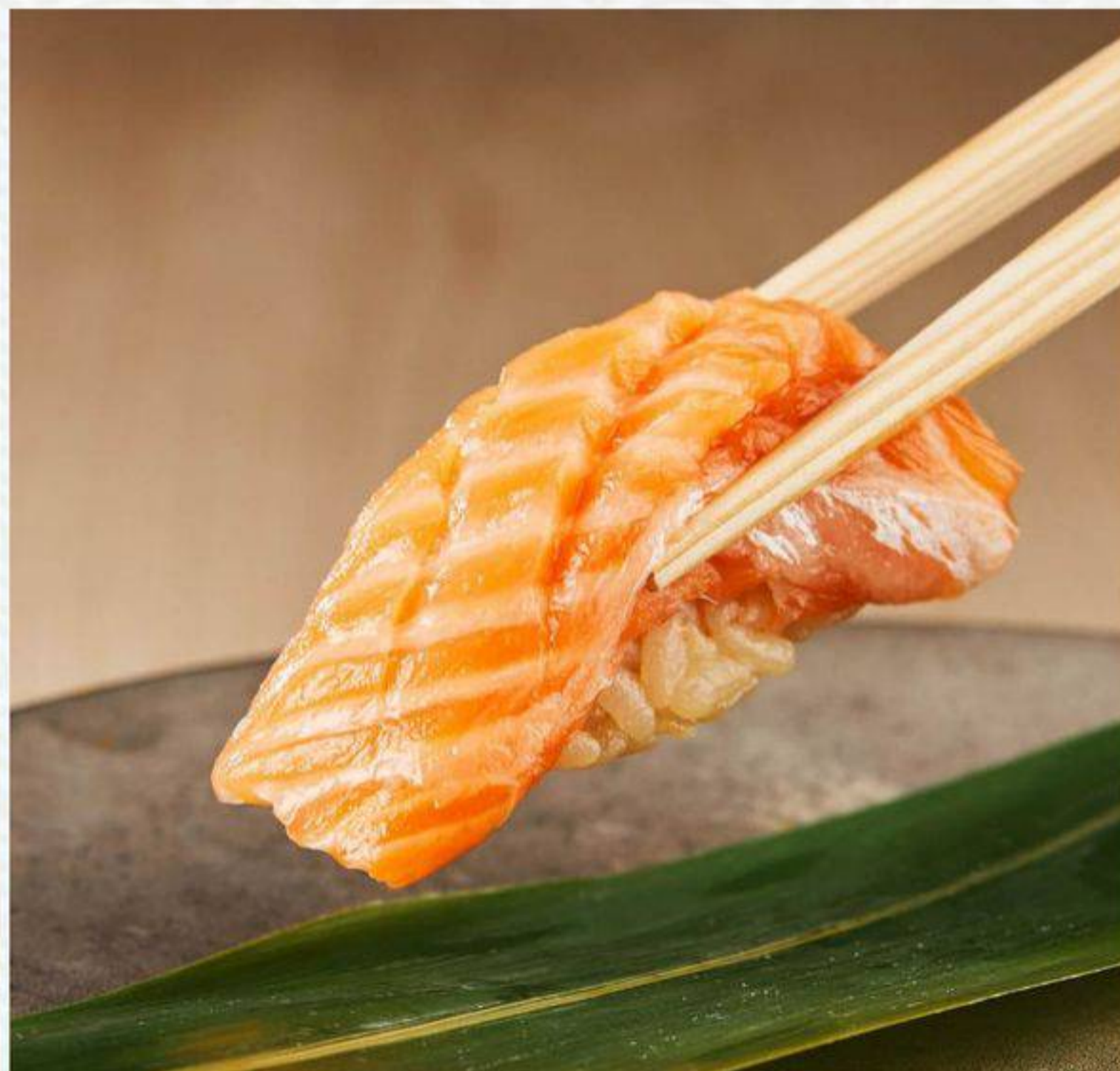
❖ 三文鱼腩寿司 Sake salmon belly sushi MOP 32