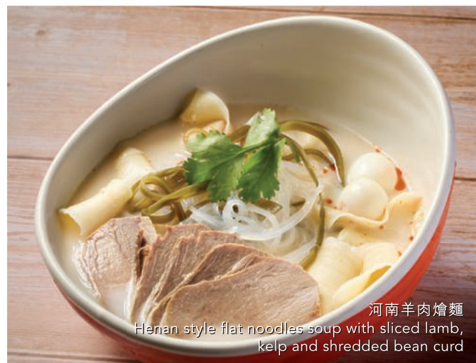
河南羊肉燴麵 Henan style flat noodles soup with sliced lamb, kelp and shredded bean curd