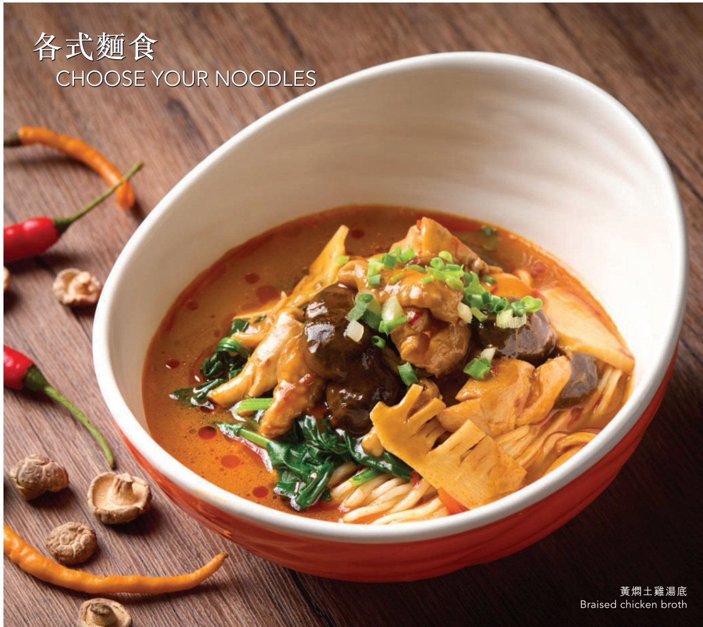
黃燜土雞湯底 Braised chicken broth