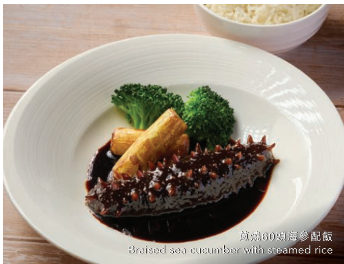
蔥燒60頭海參配飯 Braised sea cucumber with steamed rice