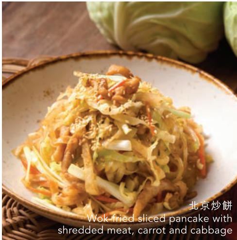
北京炒餅 Wok-fried sliced pancake with shredded meat, carrot and cabbage