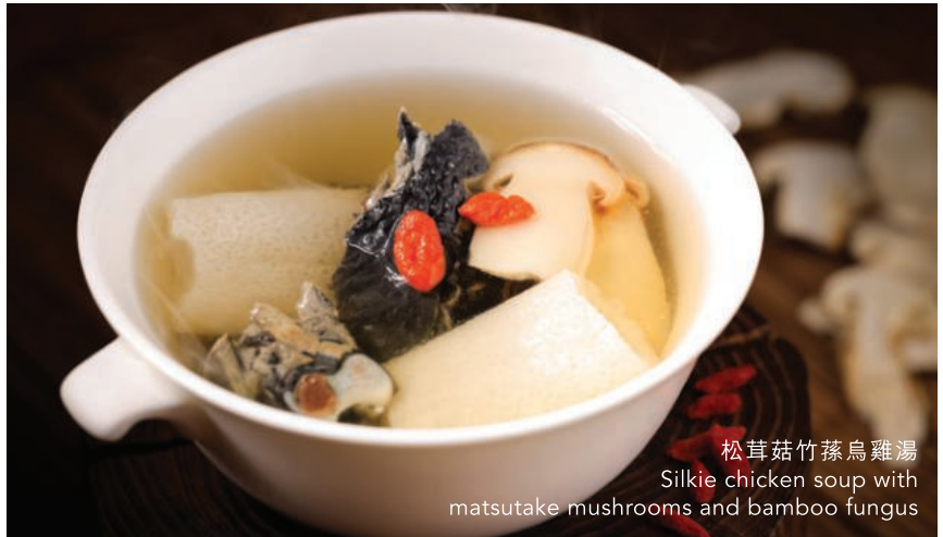
松茸菇竹蓀烏雞湯 Silkie chicken soup with matsutake mushrooms and bamboo fungus