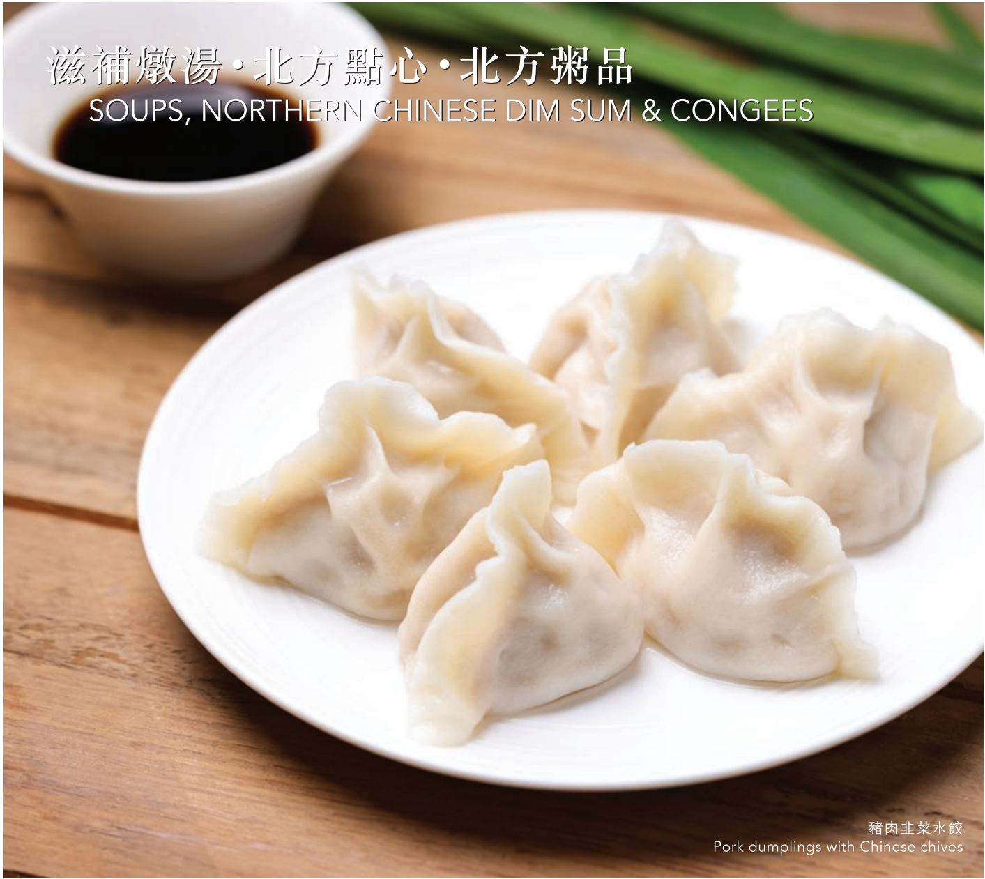
豬肉韭菜水餃 Pork dumplings with Chinese chives

SOUPS, NORTHERN CHINESE DIM SUM & CONGEEES