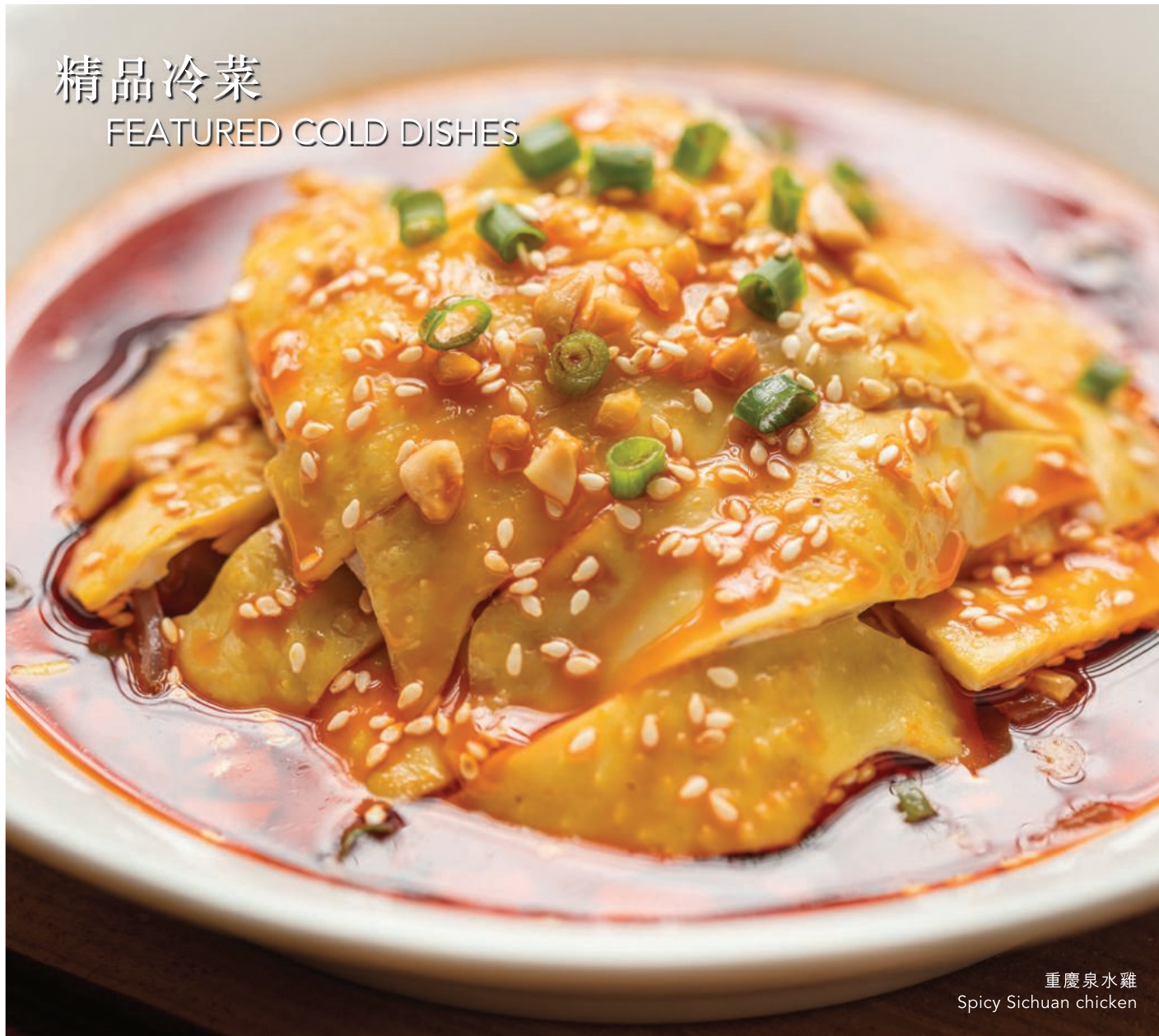
重慶泉水雞 Spicy Sichuan chicken