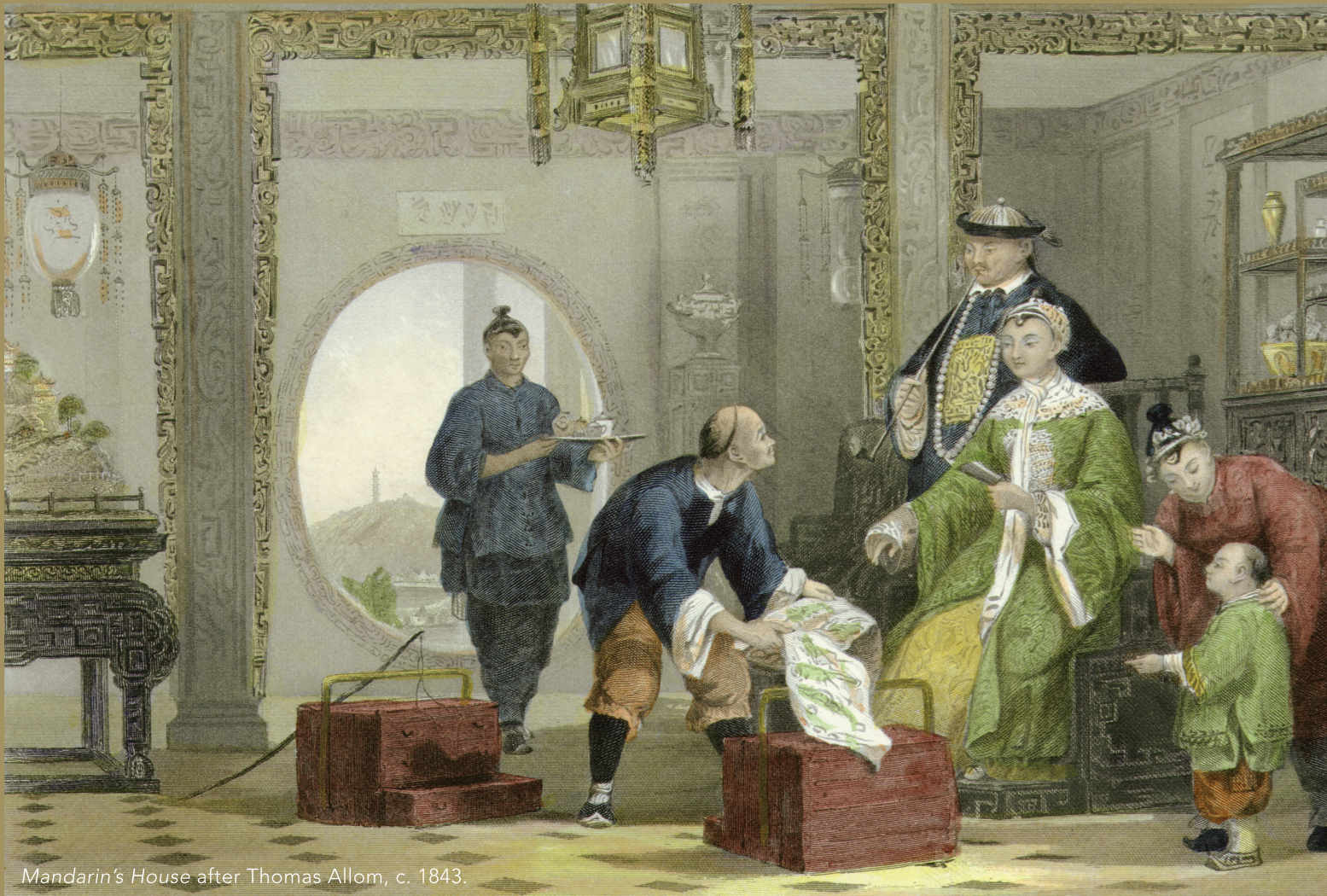
Mandarin's House after Thomas Allom, c. 1843.